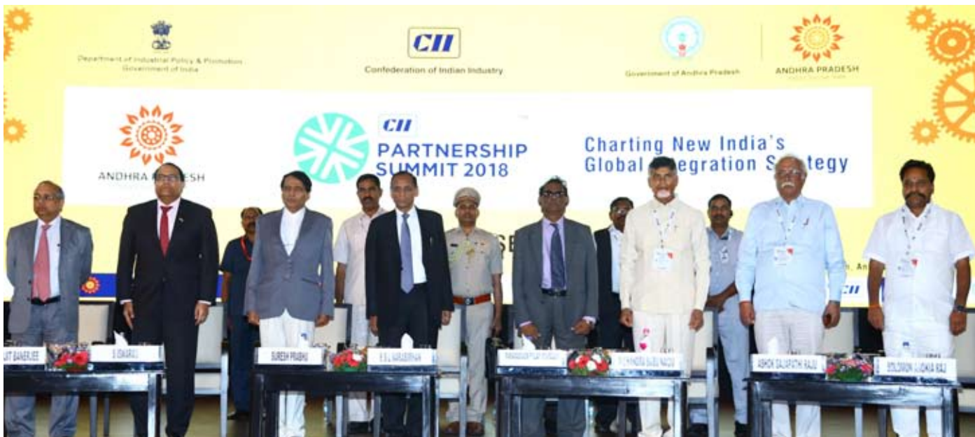
(L-R): Mr Chandrajit Banerjee, Director General, Confederation of Indian Industry; Mr S Eswaran, Hon'ble Minister for Trade & Industry, Singapore; Mr Suresh Prabhu, Hon'ble Minister of Commerce & Industry, Government of India; Mr E S L Narasimhan, Hon'ble Governor of Andhra Pradesh and Telangana; Mr Paramasivum Pillay Vyapoory, Hon'ble Vice President of Mauritius; Mr N Chandrababu Naidu, Hon'ble Chief Minister of Andhra Pradesh; Mr Ashok Gajapati Raju, Hon'ble Minister of Civil Aviation, Government of India; Mr Solomon Arokia Raj, Secretary, Department of Industries & Commerce, Government of Andhra Pradesh, at the Valedictory Session

Minister himself engaged in over 55 bilateral meetings during the event. The Summit drew the participation of 4,253 delegates from India and 50 other countries.